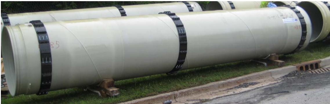
Figure 3: Steel Pipe Liner Sections with Casing Spacers

Once the test pipe had been pulled through a section of the distressed PCCP line, the slipling process was begun. Each section of Steel Pipe liner was fitted with either three or four sets of casing spacers, depending on the length of the section being lined Fig 3.