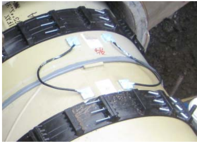
Figure 4: Joint Bonding for Electrical Continuity

In addition to the air-testing performed on each individual joint, every joint was also fitted with a continuous electrical bonding connection, Fig. 4, to assist in the corrosion control plan for the project developed by Brouco Services of Ottawa, Ontario. This joint bonding connection was made just prior to the engagement of the double gasketed O-ring liner pipe joint.